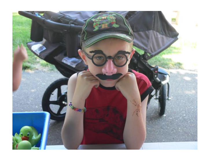
Cheese Curd Fest Participant