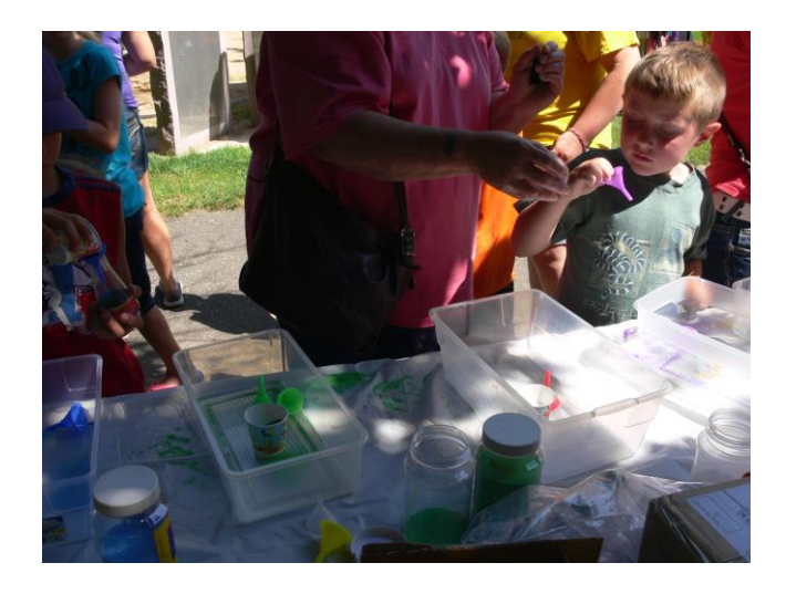
Sand Art at Cheese Curd Fest