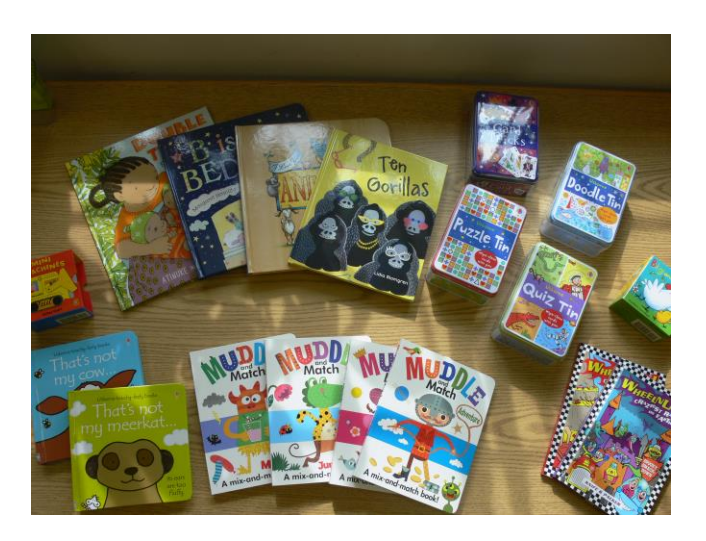
Usborne Book Fair Goodies