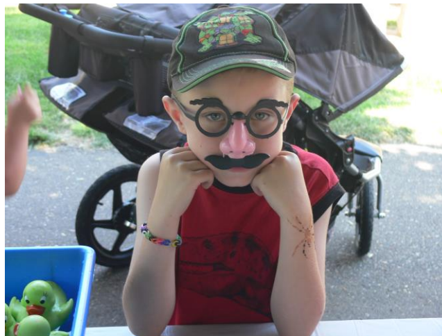
Cheese Curd Fest Participant