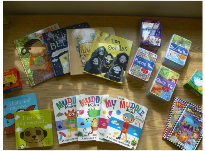
Usborne Book Fair Goodies