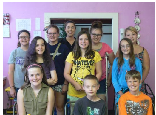
Cooking Class for Teens