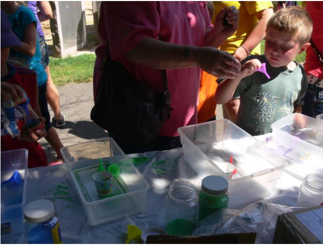
Sand Art at Cheese Curd Fest