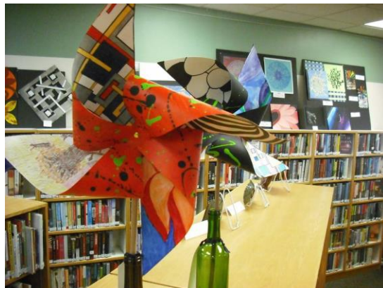
EMS/EHS Art Display