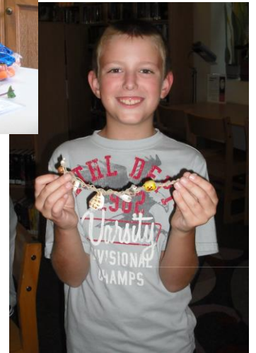
Donation from Pierce County Farm Bureau