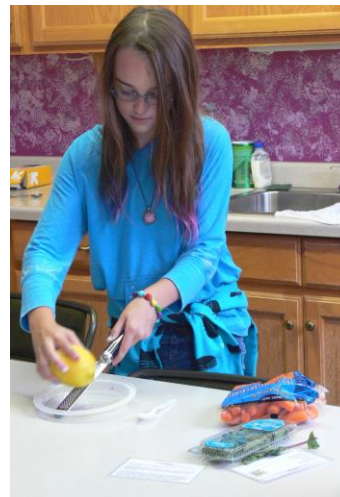
Teen Program Participants: Cooking & Ancient Arts

www.more.lib.wi.us www.facebook.com www.google.com www.ellsworthlibrary.org ifls.freeding.com Other