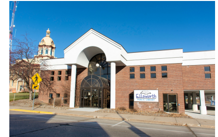
MAIN STREET VIEW