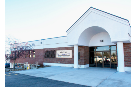
KINNE STREET VIEW